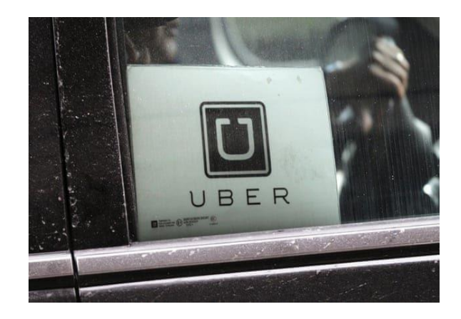
notify drivers that hackers had stolen

Uber will pay $148m and tighten data security after the ridehailing company failed for a year to